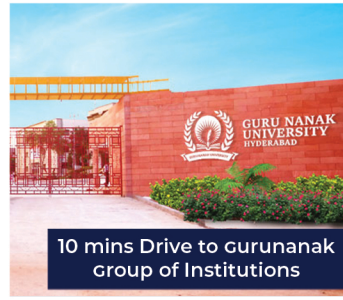
10 mins Drive to gurunank group of Institutions