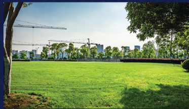
Parks and landscapes