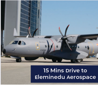
15 Mins Drive to Eleminedu Aerospace