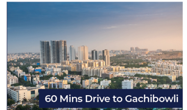
60 Mins Drive to Gachibowli