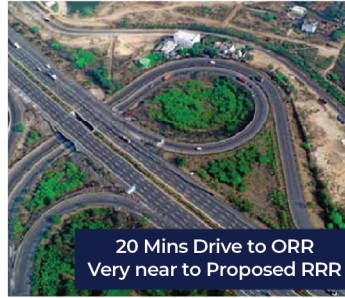
20 Mins Drive to ORR Very near to Proposed RRR