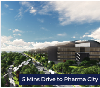
5 Mins Drive to Pharma City