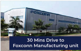
30 Mins Drive to Foxconn Manufacturing unit