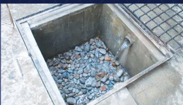
Water harvesting pits