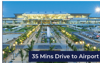
35 Mins Drive to Airport