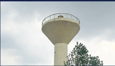
Overhead water tank