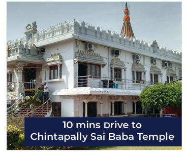
10 mins Drive to Chintapally Sai Baba Temple