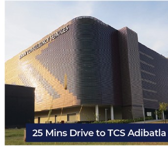
25 Mins Drive to TCS Adibatla