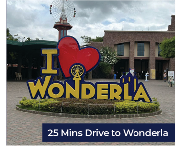
25 Mins Drive to Wonderla