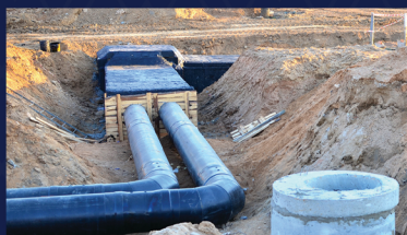
Drainage and sewerage facility