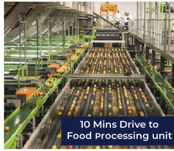
10 Mins Drive to Food Processing unit