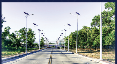
Streetlights and side walks